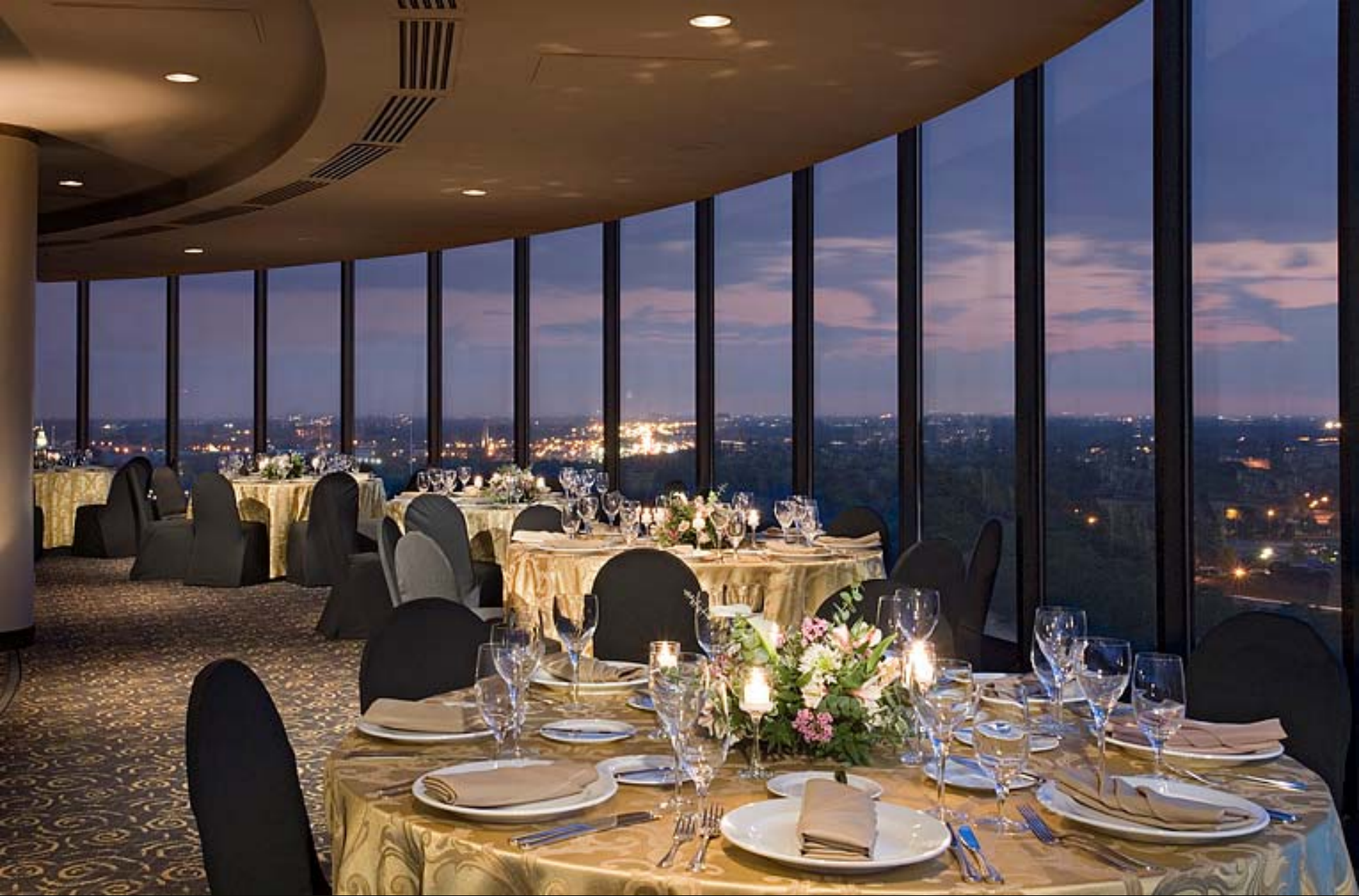
HYATT REGENCY DEARBORN Detroit Metropolitan Area